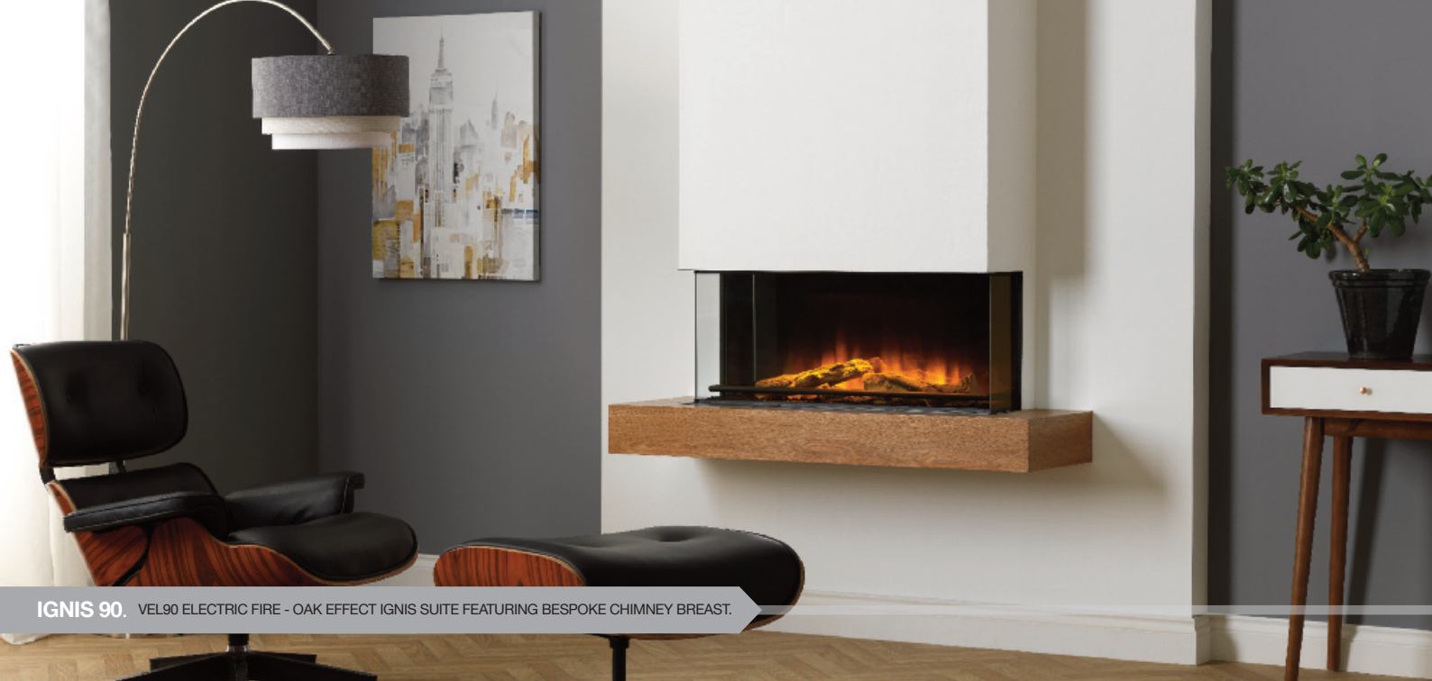
IGNIS 90. VEL90 ELECTRIC FIRE - OAK EFFECT IGNIS SUITE FEATURING BESPOKE CHIMNEY BREAST.