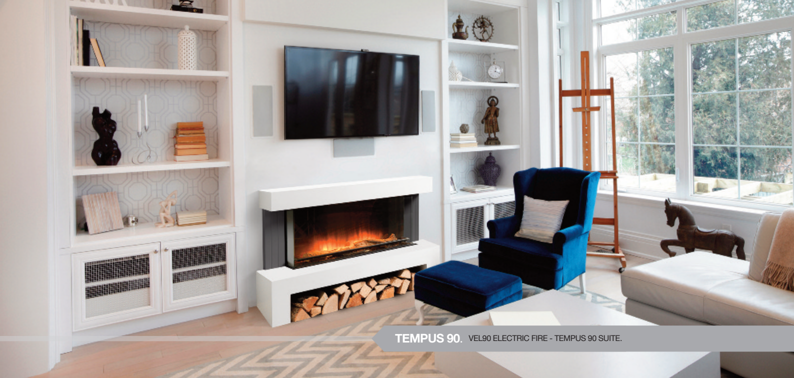
TEMPUS 90. VEL90 ELECTRIC FIRE - TEMPUS 90 SUITE.