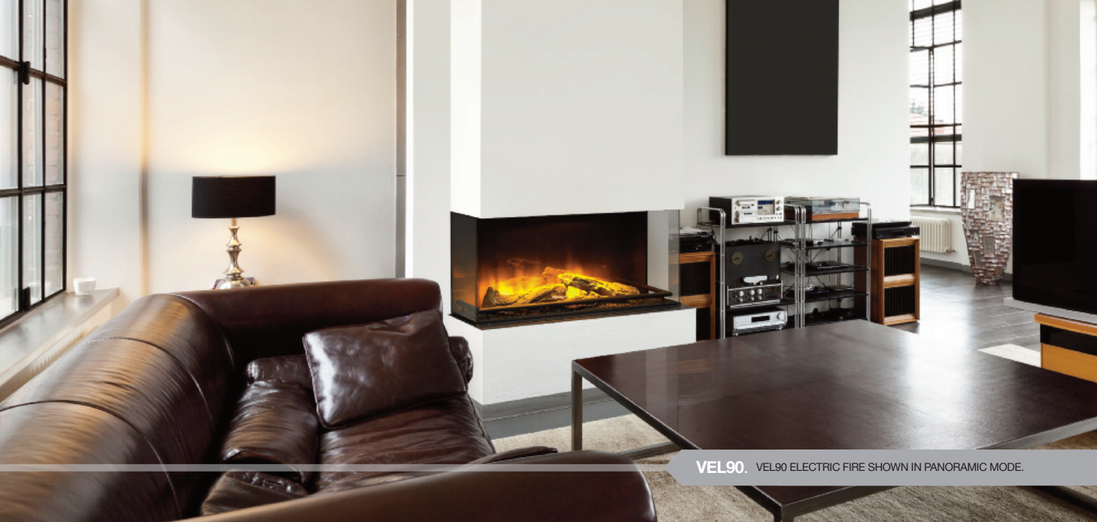
VEL90. VEL90 ELECTRIC FIRE SHOWN IN PANORAMIC MODE.