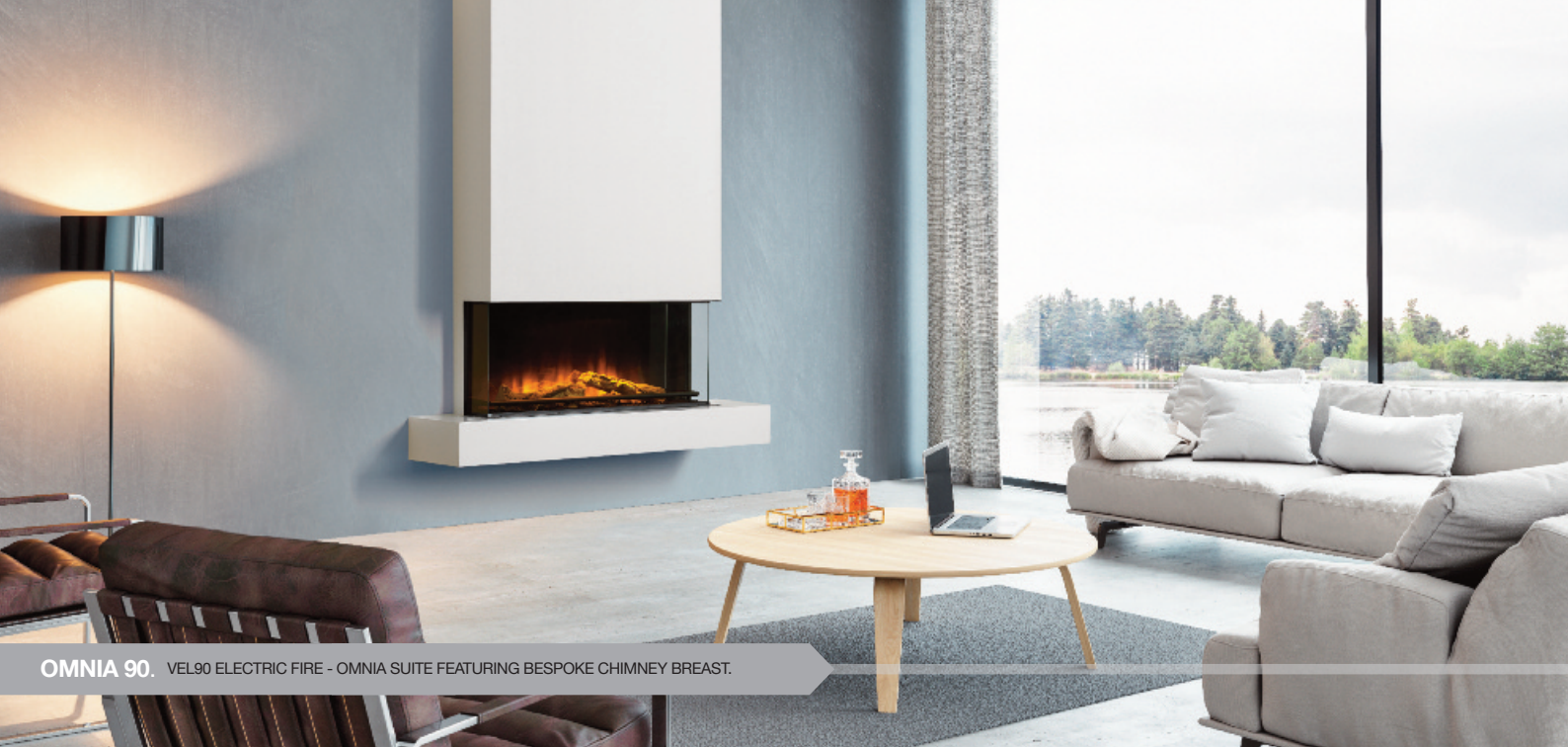
OMNIA 90. VEL90 ELECTRIC FIRE - OMNIA SUITE FEATURING BESPOKE CHIMNEY BREAST.