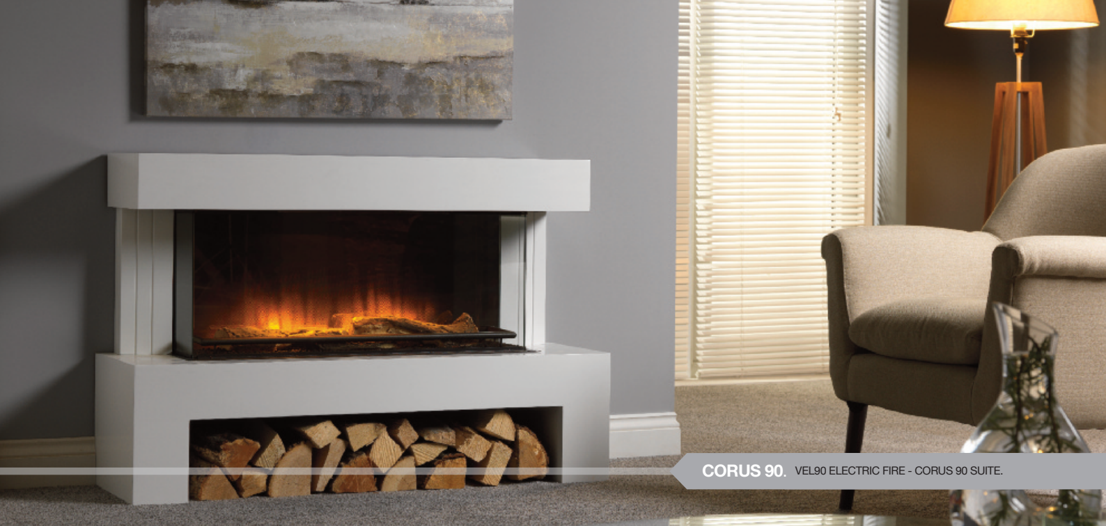
CORUS 90. VEL90 ELECTRIC FIRE - CORUS 90 SUITE.