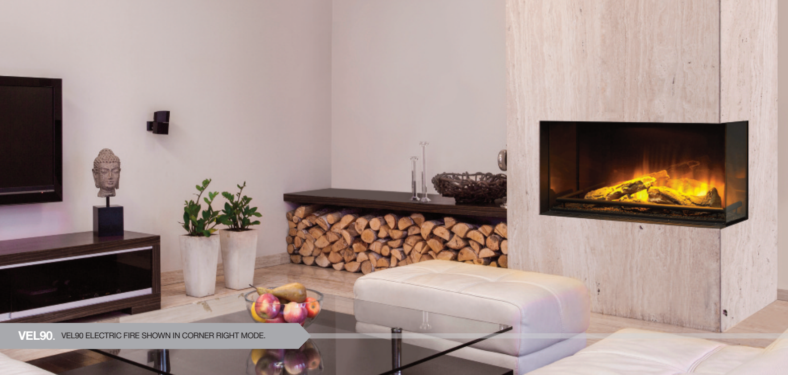
VEL90. VEL90 ELECTRIC FIRE SHOWN IN CORNER RIGHT MODE.