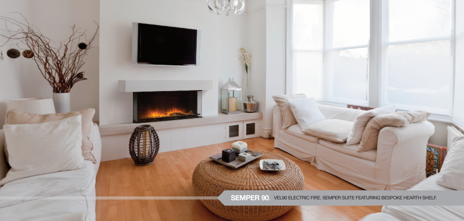
SEMPER 90. VEL90 ELECTRIC FIRE. SEMPER SUITE FEATURING BESPOKE HEARTH SHELF.