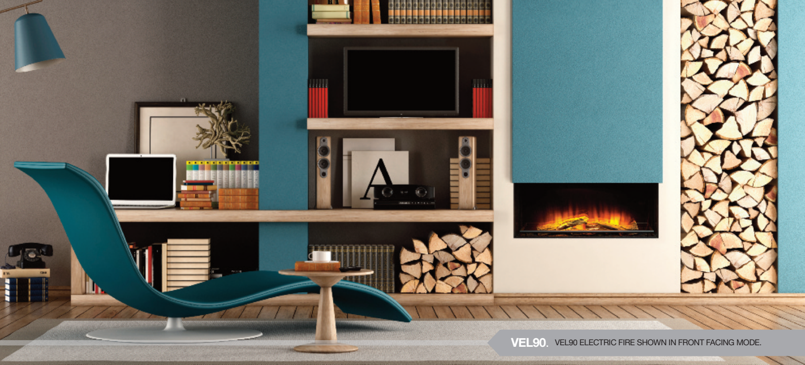
VEL90. VEL90 ELECTRIC FIRE SHOWN IN FRONT FACING MODE.